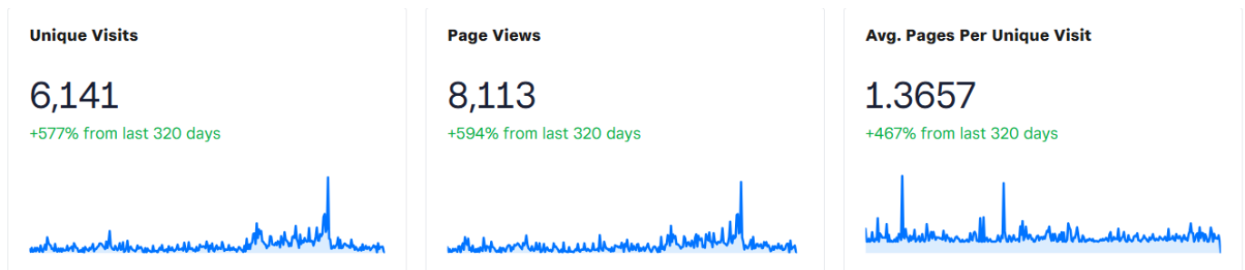
figure 2 - Web Site Activity March 2025 to February 2026

The traffic breakdown is shown in the charts below. Compared to the last reporting period, there has been a slight increase in the number of unique visitors, resulting in an increase in page views. However, nearly all visits result in a single page view. This implies that visitors expect to see what they need on the page that they land on. There is no way of telling if a visit yields what is wanted or not.